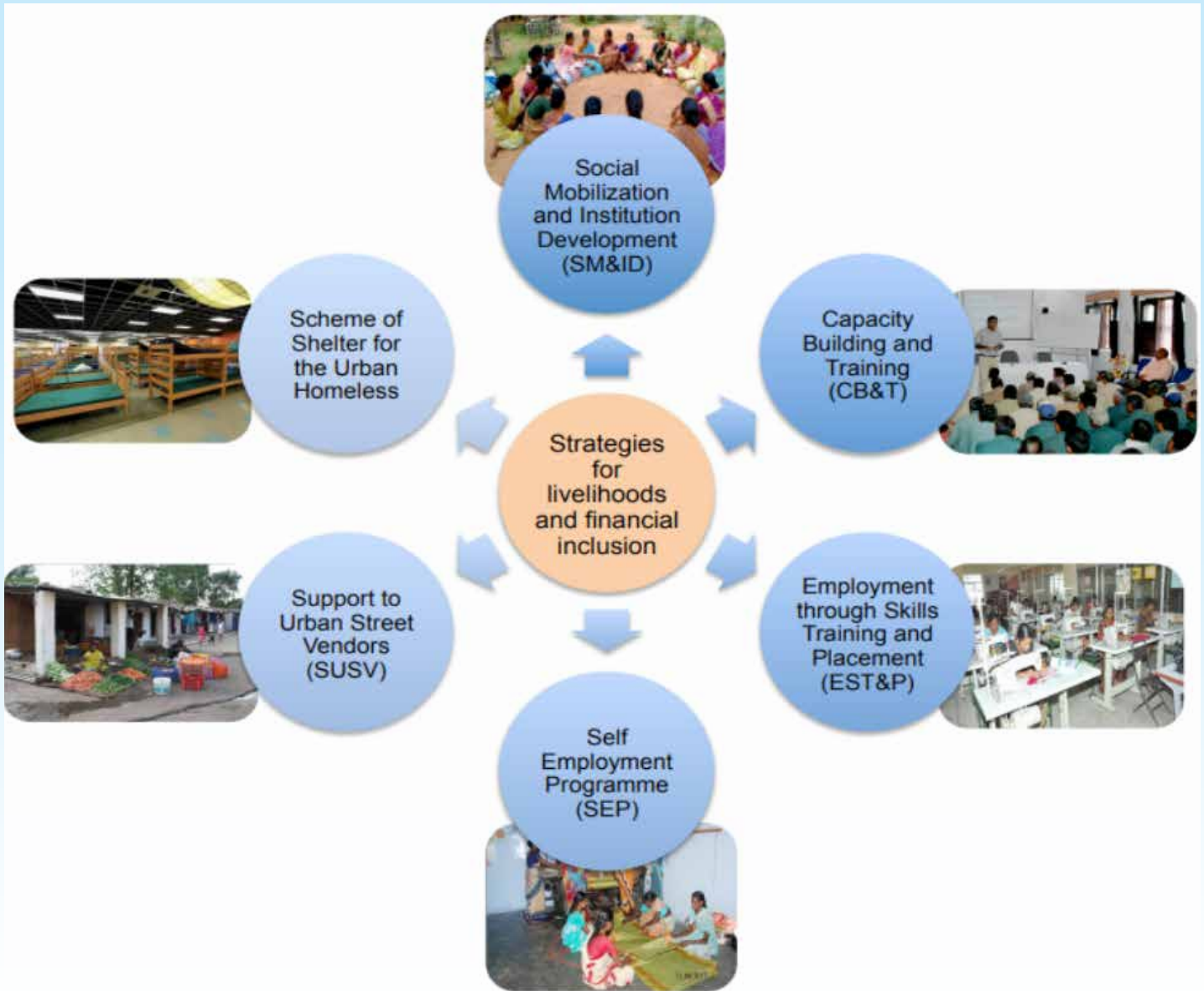
Components of a City Livelihood Plan