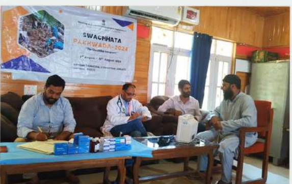
MC LANGATE Medical Camp for Sanitation Workers