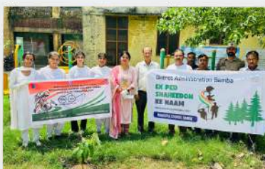
MC SAMBA Plantation Drive