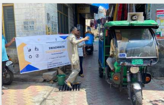
MC REASI Door to Door Awareness