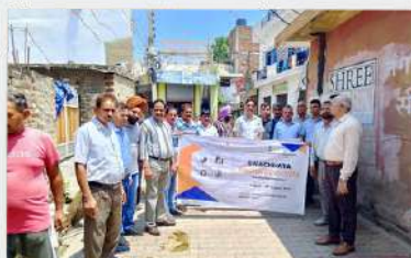
MC R.S PURA Community Awareness Drive