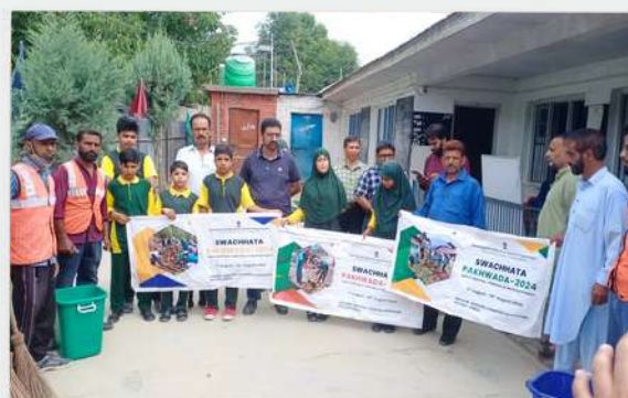
MC AWANTIPORA Awareness Drive at Educational Institutions