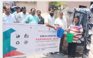
MC LAKHANPUR Door to Door Awareness