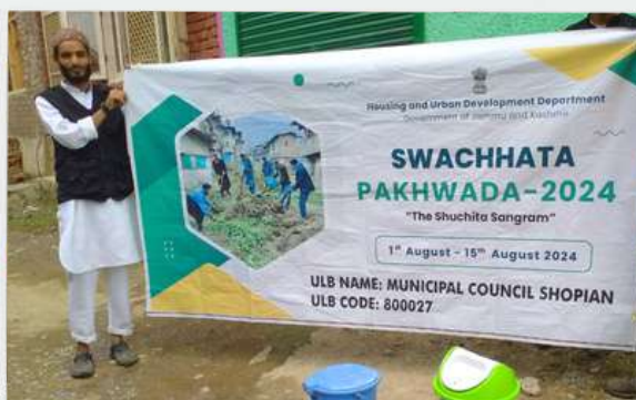
MC SHOPIAN Awareness Drive at Religious Institutions