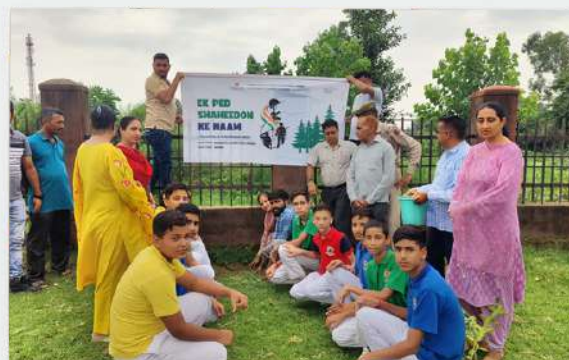
MC PAROLE Plantation Drive