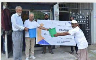
MC BARI BRAHMANA Door to Door Awareness