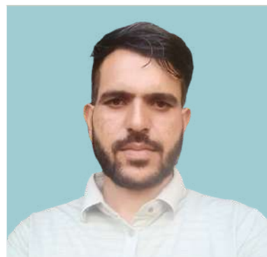
Mohd. Ashraf Doda Municipal Council