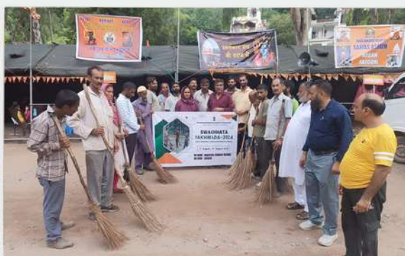
MC RAJOURI Sanitation Drive at Religious Institutions