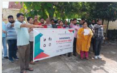
MC LAKHANPUR Swachhata Pledge