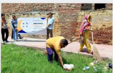
MC R.S PURA Cleaning of Waterbodies