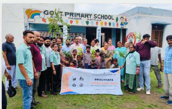
MC KATHUA Awareness Drive at Educational Institutions