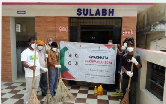
MC KATRA Cleaning of CT/PT's