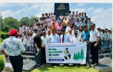
MC SAMBA Sanitation Drive at Tourist Places