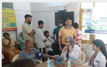
MC BISHNAH Medical Camp for Sanitation Workers