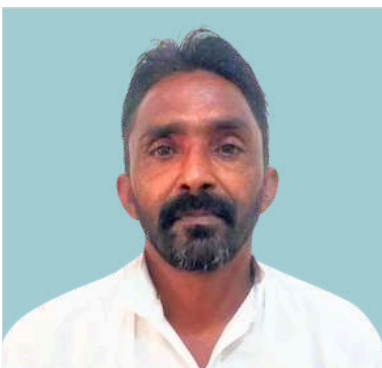
Gouri Munshi Kathua Municipal Council