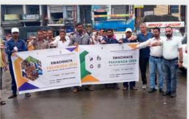
MC LAKHANPUR Swachhata Pledge