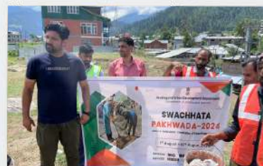
MC BHADERWAH Elimination of Garbage Vulnerable Points