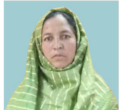
Jameela Banoo Pulwama Municipal Council