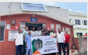
MC RAJOURI Cleaning of CT/PT's