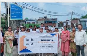
MC ARNIA Community Awareness Drive