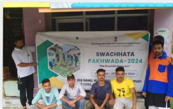
MC SHOPIAN Community Awareness