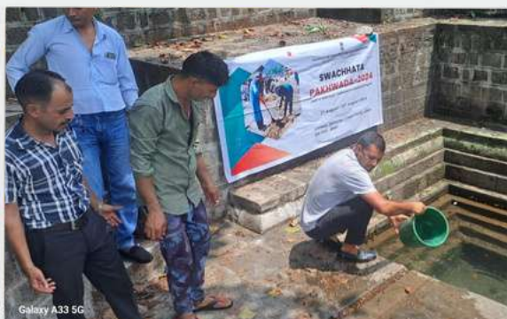
MC BILLAWAR Cleaning of Waterbodies