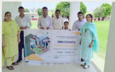
MC GHOUMANHSAN Awareness Drive at Educational Institutions