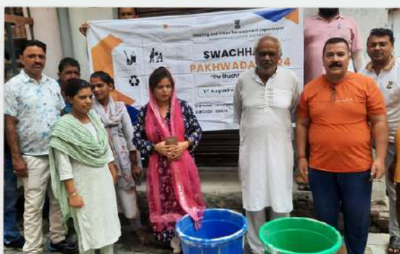
MC HIRANAGAR Community Awareness Drive