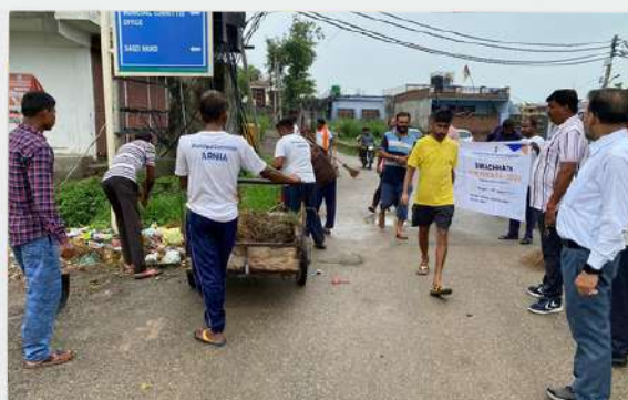
MC ARNIA Elimination of Garbage Vulnerable Points (GVP)