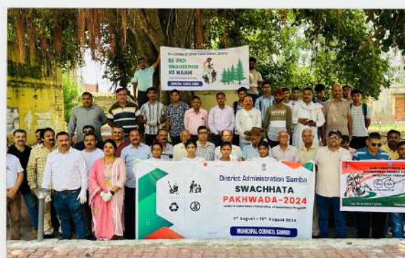
MC SAMBA Sanitation Drive at Tourist Places