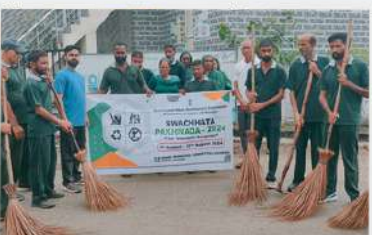
MC JOURIAN Sanitation Drive at Religious Institutions