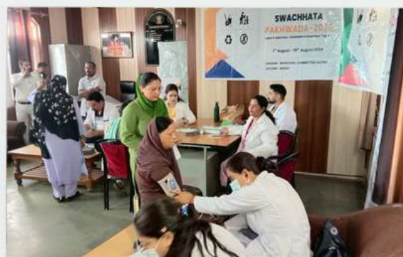
MC KATRA Medical Camp for Sanitation Workers