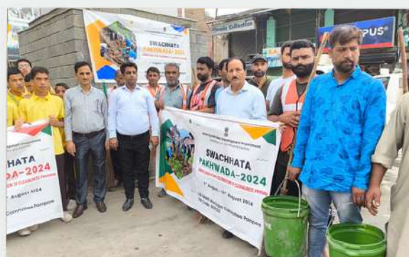
MC PAMPORE Community Awareness