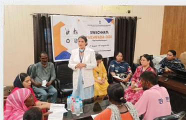
MC RAMGARH Medical Camp for Sanitation Workers