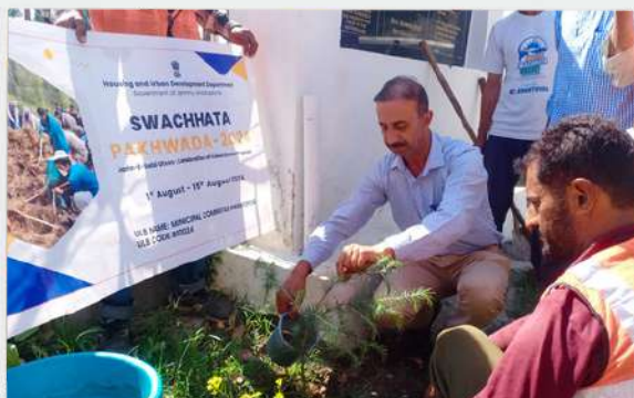
MC AWANTIPORA Plantation Drive