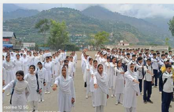
MC POONCH Awareness Drive at Educational Institutions