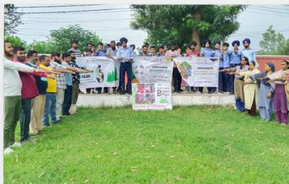
MC NOWSHERA Swachhata Pledge